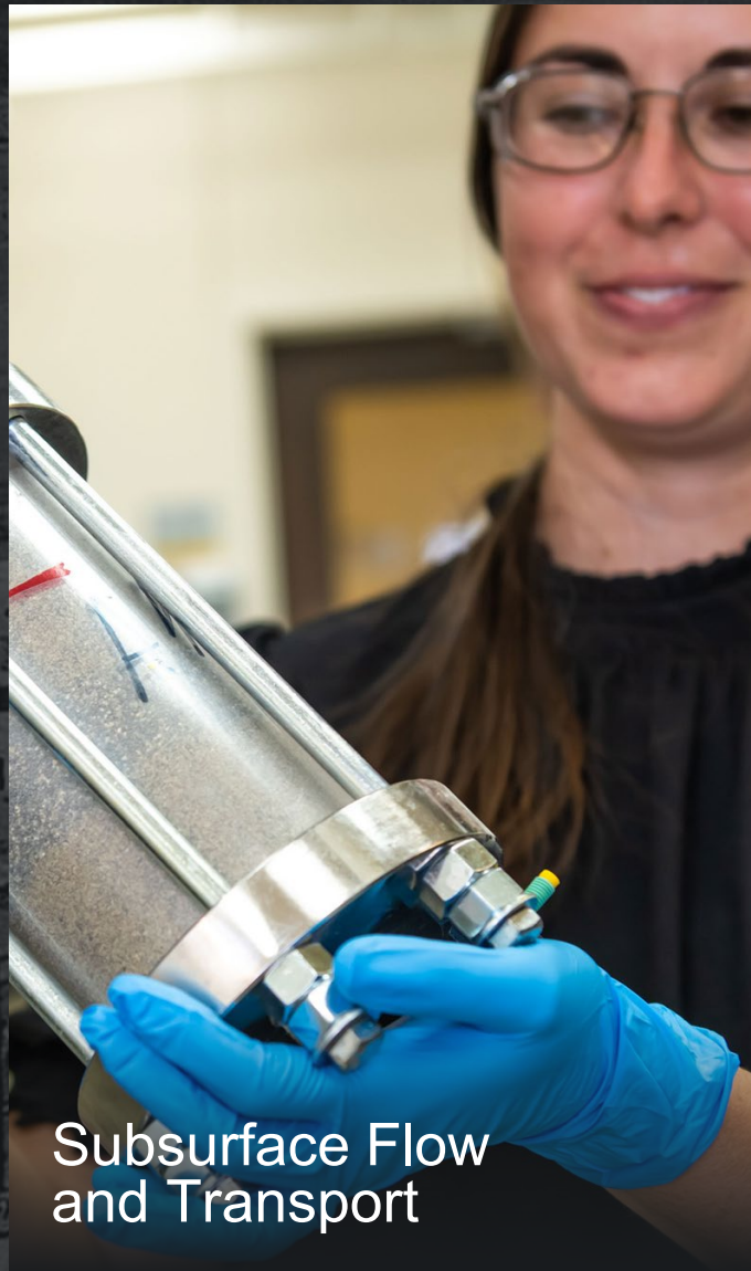
Subsurface Flow and Transport